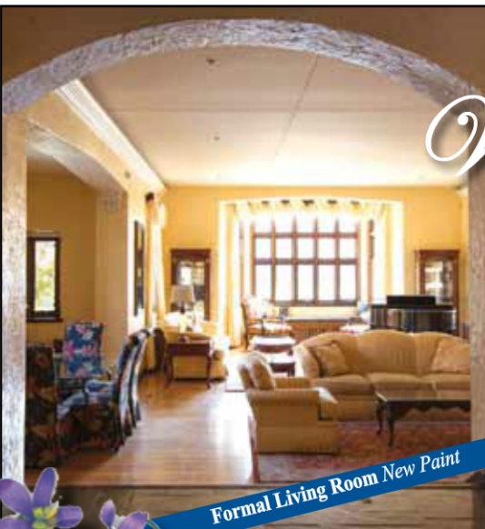
Formal Living Room New Paint