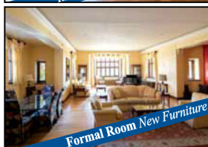
Formal Room New Furniture