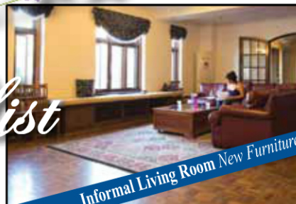
Informal Living Room New Furniture