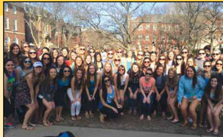
Walk a Mile event.

McDonald House Charities. We served BBQ pulled pork sandwiches, macaroni and cheese, coleslaw, fruit, and cookies! Unfortunately, it was pouring rain last Sunday in Champaign so our kickball tournament was cancelled due to liability at the Champaign Park District level. The enthusiasm shown by the teams, however, was very encouraging and hopefully our next